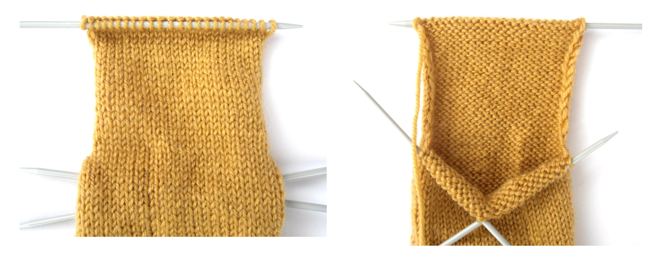
The heel flap outside and inside views

Next the heel is turned to make a little cup shape. This is done by a series of short rows.