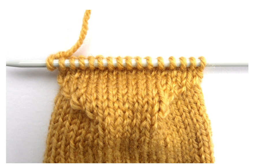
The turned heel

Repeat rows 3-4 until all stitches have been worked 14 (14,16) stitches remain Knit 1 row